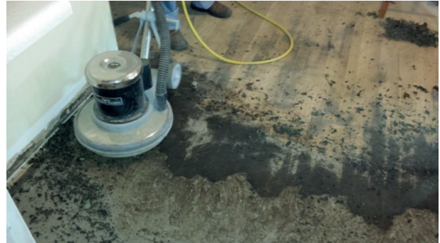
Figure 5. Floor-scabbler equipment designed for the purpose to prepare floor-surfaces. Removal of various remains, e.g.; adhesive, tar and bitumen.