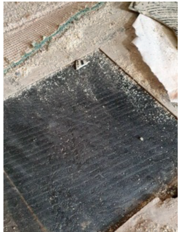
Figure 2.2. Sticky bitumen present