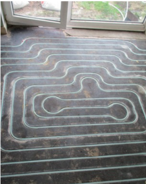
Figure 8. Negative asbestos result and non-sticky black surface can be cut with the JK floorgrinder to install the JK® system.