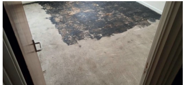
Figure 6. Result of floor partly prepared with floor-scabbler