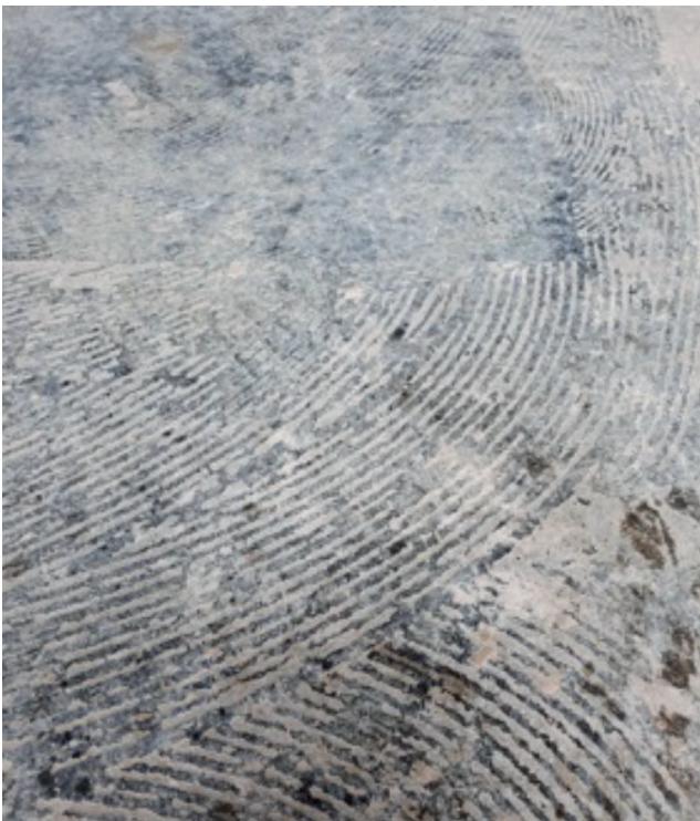
Figure 3. Black non-sticky floor after removal of old floor-finish