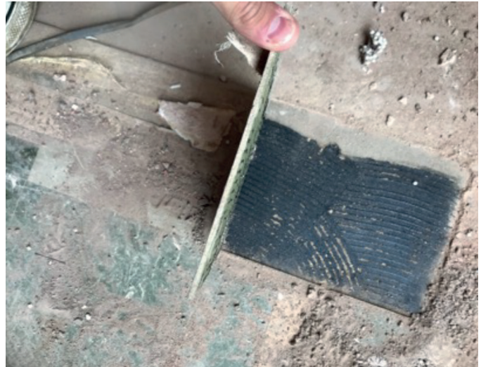
Figure 2.1. Sticky bitumen under ceramic tile