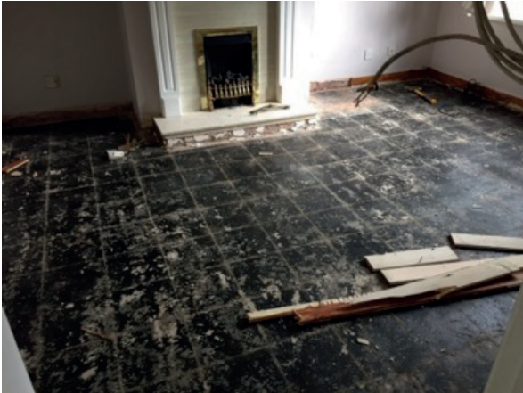
Figure 4. Black (sticky) floor after removal old floor-finish

These illustrations are presented to support floor-surface examination and can be used to identify the various scenarios.