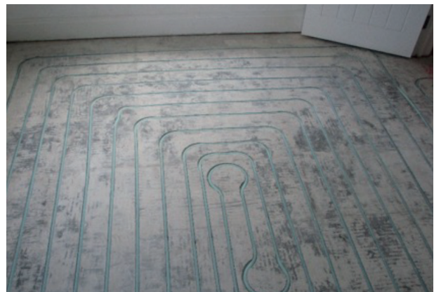
Figure 7. Fully prepared floor-surface with JK® system installed. (Concrete/Screed/Cementitious floor-surface; gray shaded)